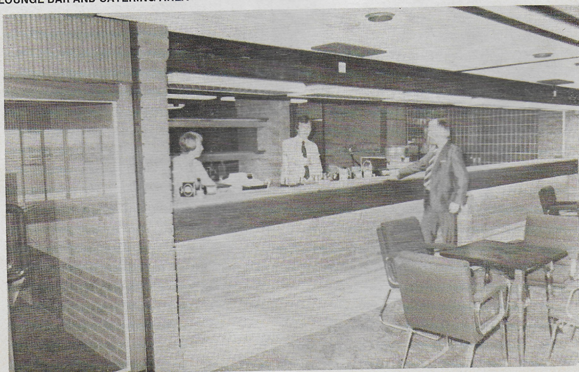
LOUNGE BAR AND CATERING AREA