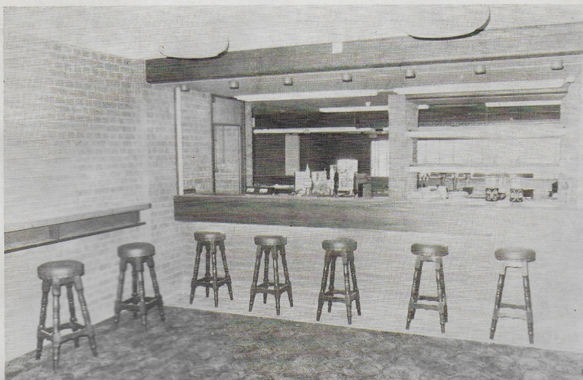
THE MEMBERS' BAR