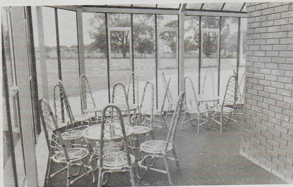
SUN LOUNGE AND CHILDREN'S AREA